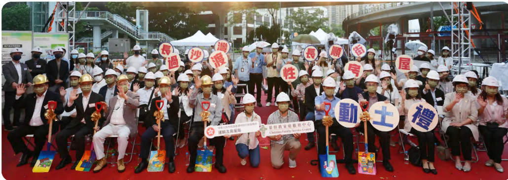
▶ 長順街過渡性房屋項目動土禮出席嘉賓合照，寄望工程順利。 A group photo was taken at the groundbreaking ceremony, to set the tone for a smooth construction process.