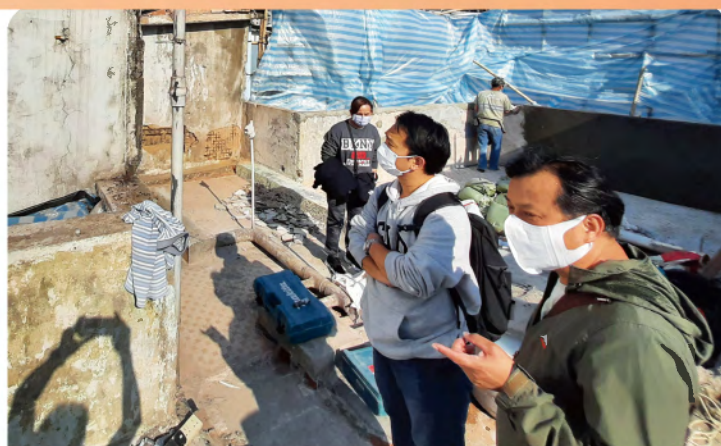
◀ 社工隊到訪「三無」大廈的業主。 The Social Service Team visited the owner of “three-nil” buildings.