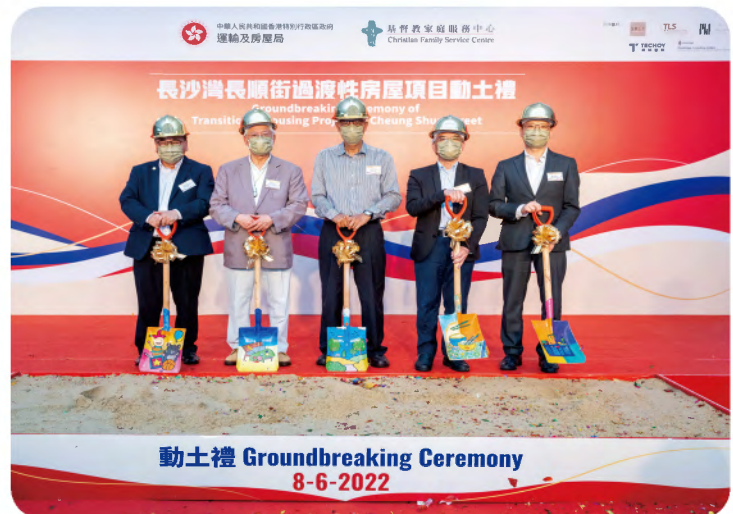
▶ 長順街項目為本會首個過渡性房屋項目。 The Cheung Shun Street Project will be CFSC's first transitional housing project.