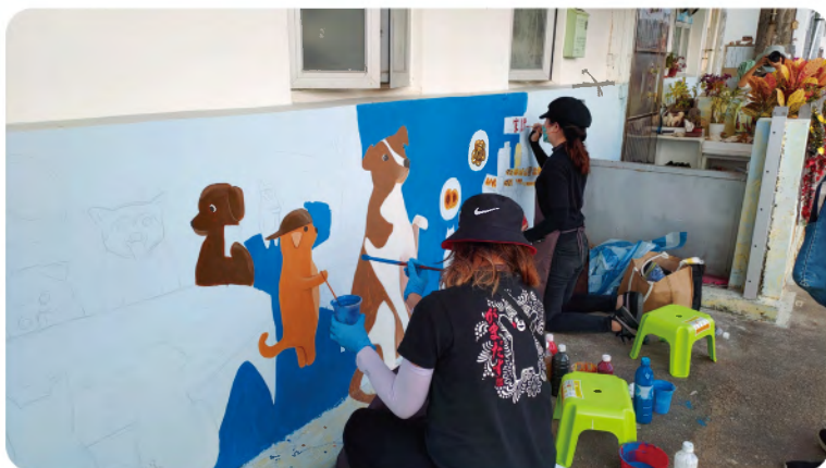
◀ 義工在鯉魚門繪畫壁畫。 Murals were painted by volunteers at Lei Yue Mun.

Recently, Lei Yue Mun NLCDP strived to organise mural painting events in the squatter area. With funding support from The Hongkong and Shanghai Banking Corporation Limited last year, local artists and volunteers were invited to paint the 12 Chinese Zodiac signs along the walls, in order to infuse elements of traditional Chinese culture into mural painting and transform the squatter area into a mural art village.